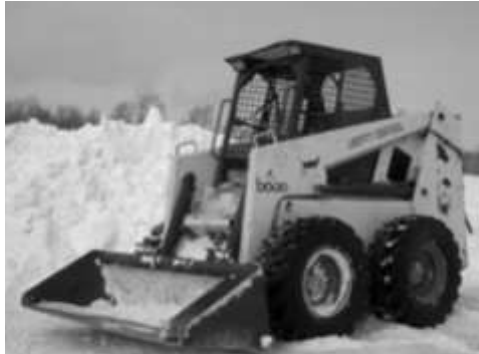
My 'new' skidloader I traded for a loader tractor and some other things I had.

The other morning I was reading in my Bible and I came across a verse that caught my attention. To start with,